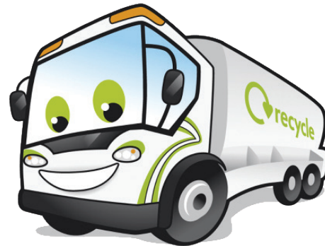
Protect frontline services